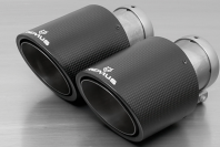
#70CS: Carbon tail pipes Ø 102 mm angled, Titanium internals