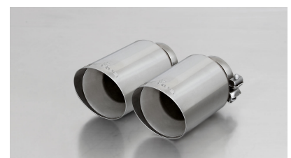
#70SG: tail pipe Ø 102 mm angled, straight cut, chromed

Werte sind ohne Abgasreinigung angegeben / Values and emissions excepted!