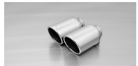
#70S: tail pipes Ø 102 mm angled, chromed